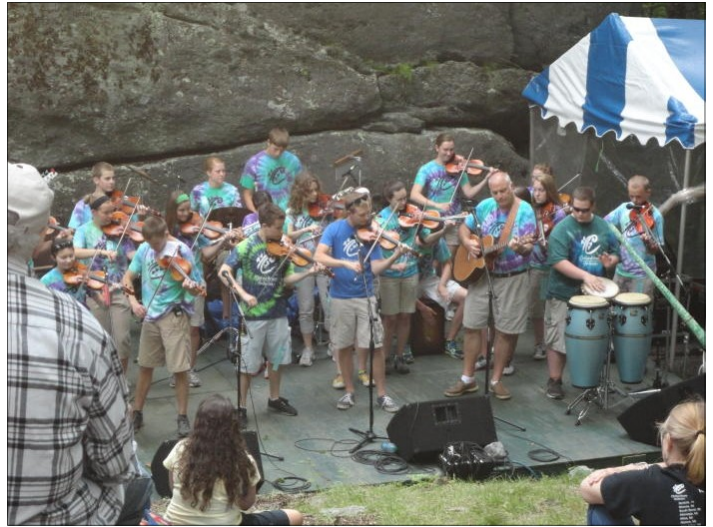
Entertainment at Grandfather Mountain Highland Games