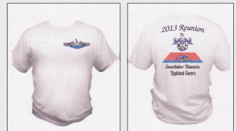
Front - 2013 Reunion - Back