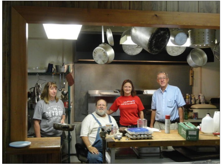
Newland, NC VFW Post 4286 - Kitchen Crew